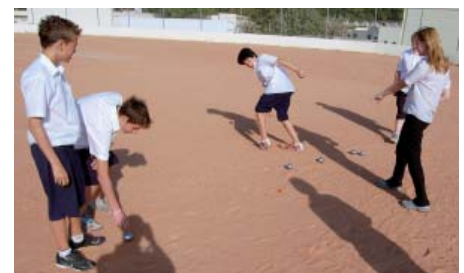
Year 9 learning French the active way