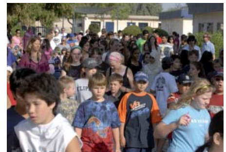
... and they're off! The annual Walkathon