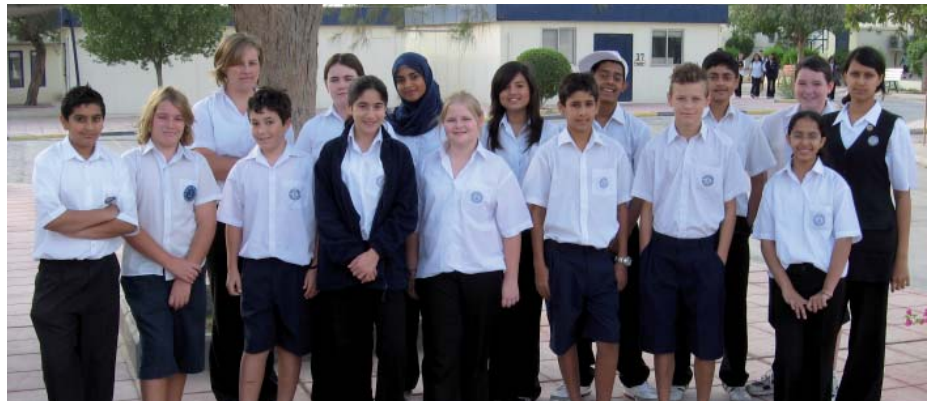
Senior School Student Council